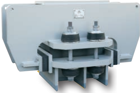
Module support Bearing Type B02

Trelleborg Ridderkerk BV used its rich experience in elastomeric bearings for bridges and shock pads for platforms to design the special module support bearings. In total 3 types have been designed for the FPSO SeaRose, the so called B01, B02 and B03. The heaviest of these elements is close to ten tonnes in weight and can withstand a vertical load of up to 10,000 kN and a horizontal load of up to 3,500 kN. The design is based on a combination of rubber and steel to compensate a displacement of 75 millimetres.