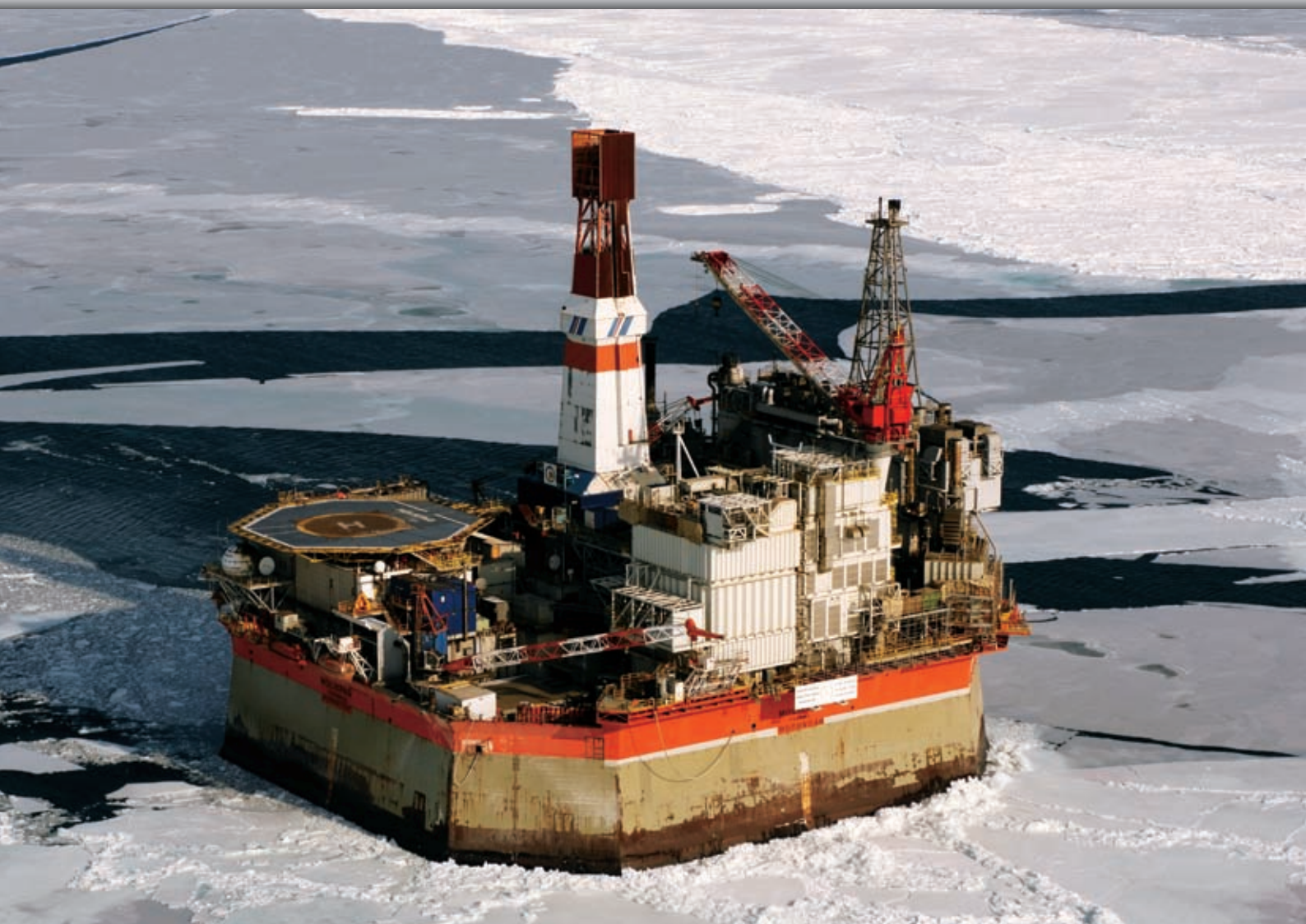
Sliding bearings for Sakhalin II PA-A Molikpaq Tie In Project