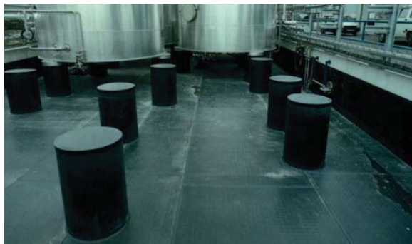
Above: BEKAPLAST™ collection tank in a manufacturing facility.