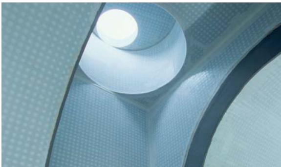
Above: Waste water collection shaft lined with natural-finish HDPE BEKAPLAST™.

BEKAPLAST™ PVC: The high impact durable material also offers extreme chemical resistance and a high level of stiffness.