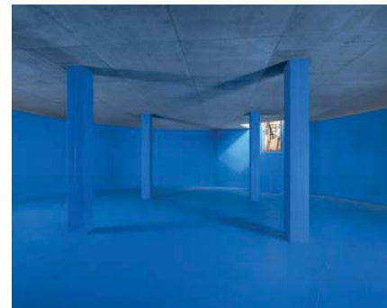
Above: BEKAPLAST™ Lining 400 lined drinking water tank.