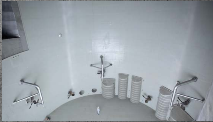
Above: Inside view of the sump area of a concrete/BEKAPLAST™ Flue Gas Desulphurisation plant with internals.

A variety of STEULER-KCH systems are available: